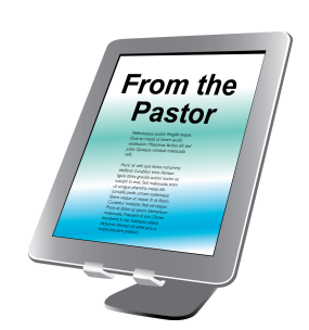
Light for Our Lives

"Your word is a lamp to my feet and a light to my path." Psalm 119:105